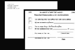
Voter Confirmation Post Card Mailings