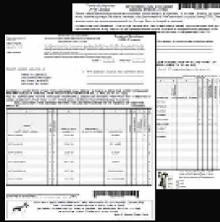
Census Form Printing & Mailing